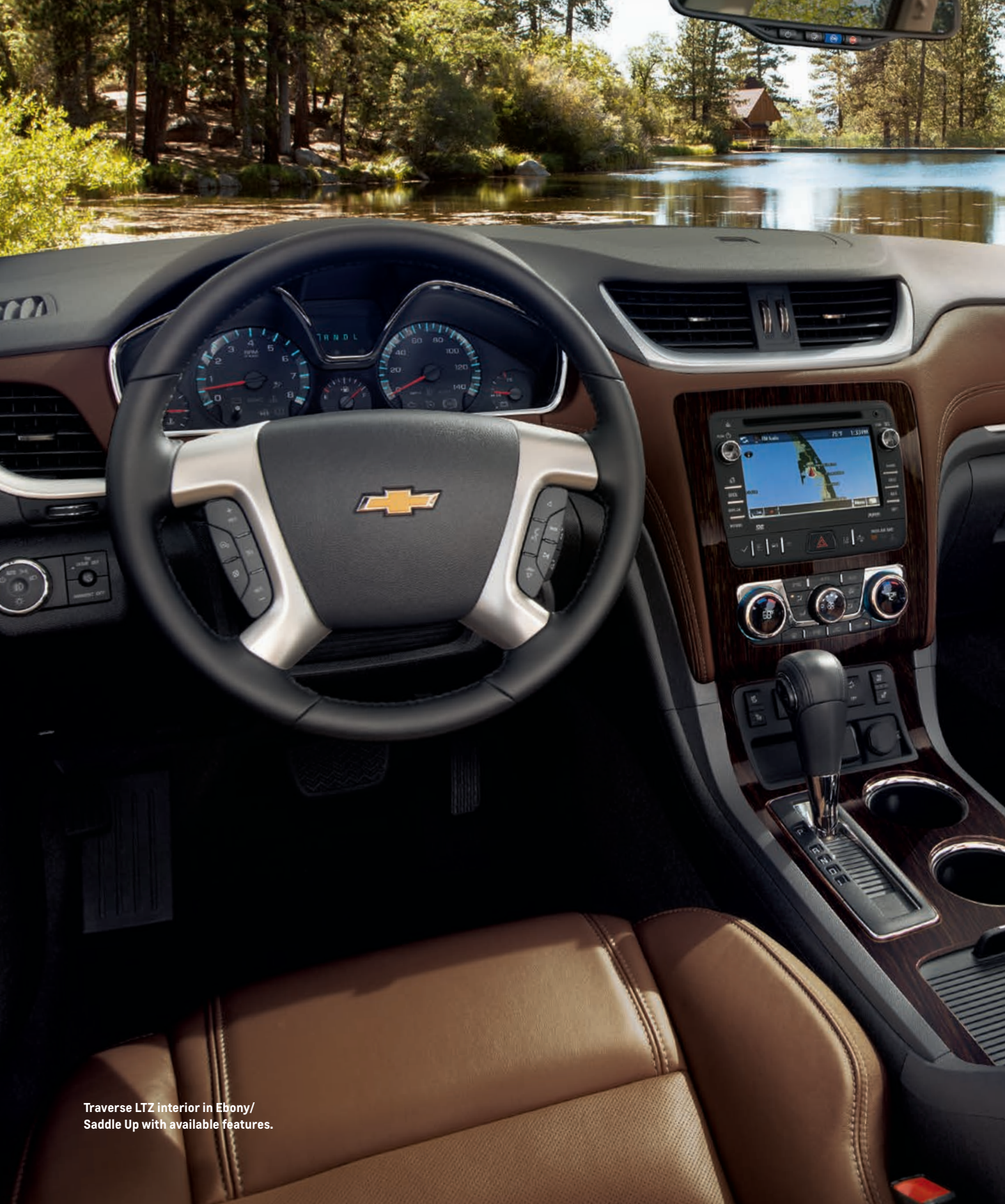
Traverse LTZ interior in Ebony/ Saddle Up with available features.

RICH REFINEMENTS. LTZ amenities include heated/cooled driver and front passenger seats, a heated steering wheel and tri-zone automatic climate controls.