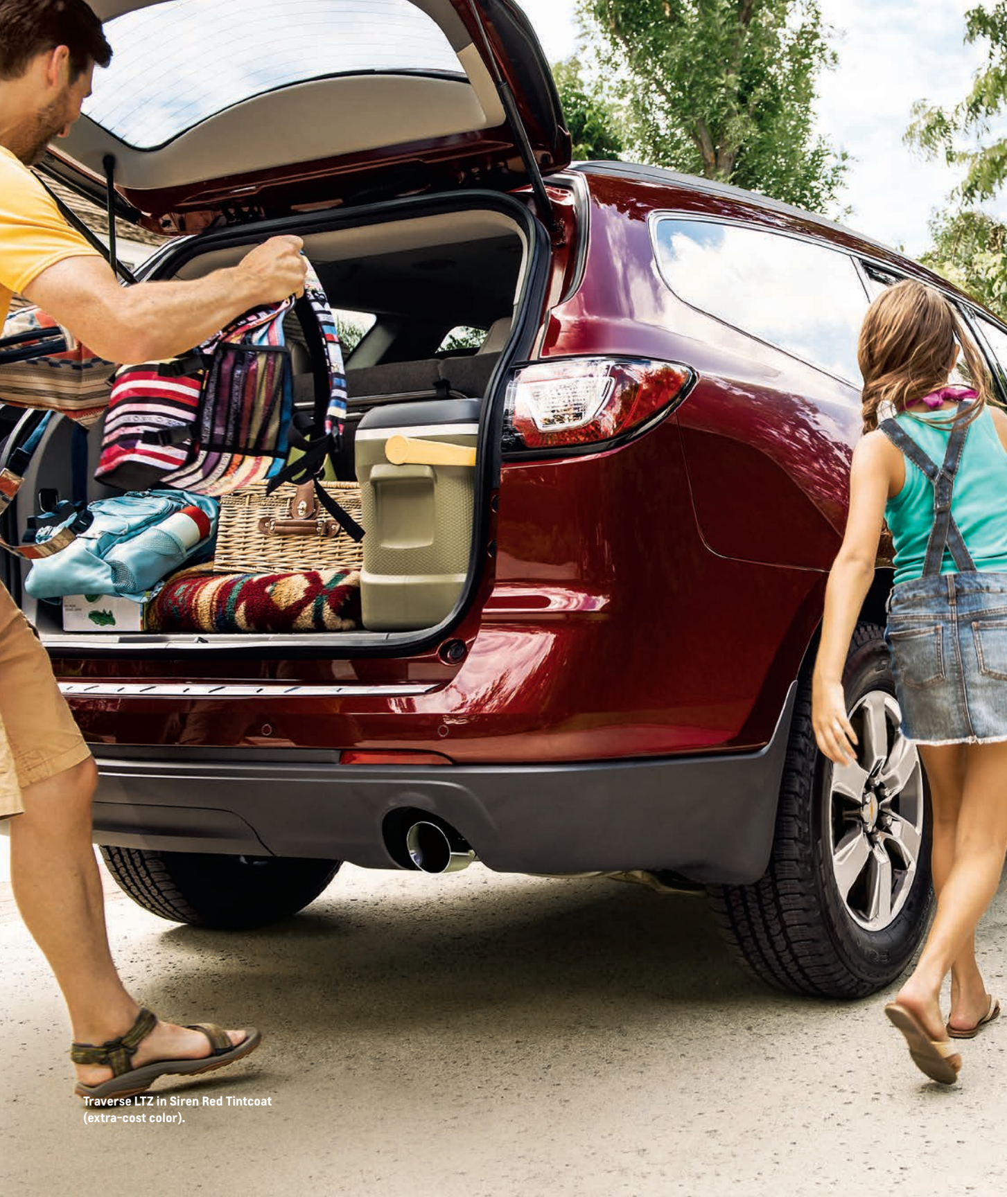
Traverse LTZ in Siren Red Tintcoat (extra-cost color).