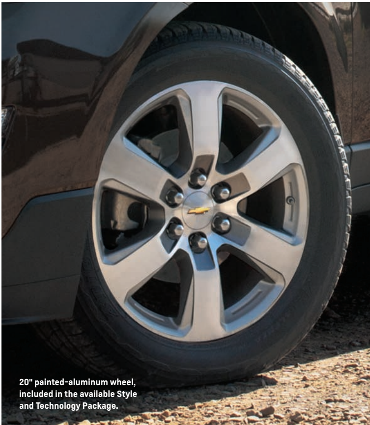
20" painted-aluminum wheel, included in the available Style and Technology Package.