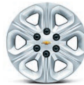
17" Steel with Painted Wheel Cover (Standard on LS Base and LS)