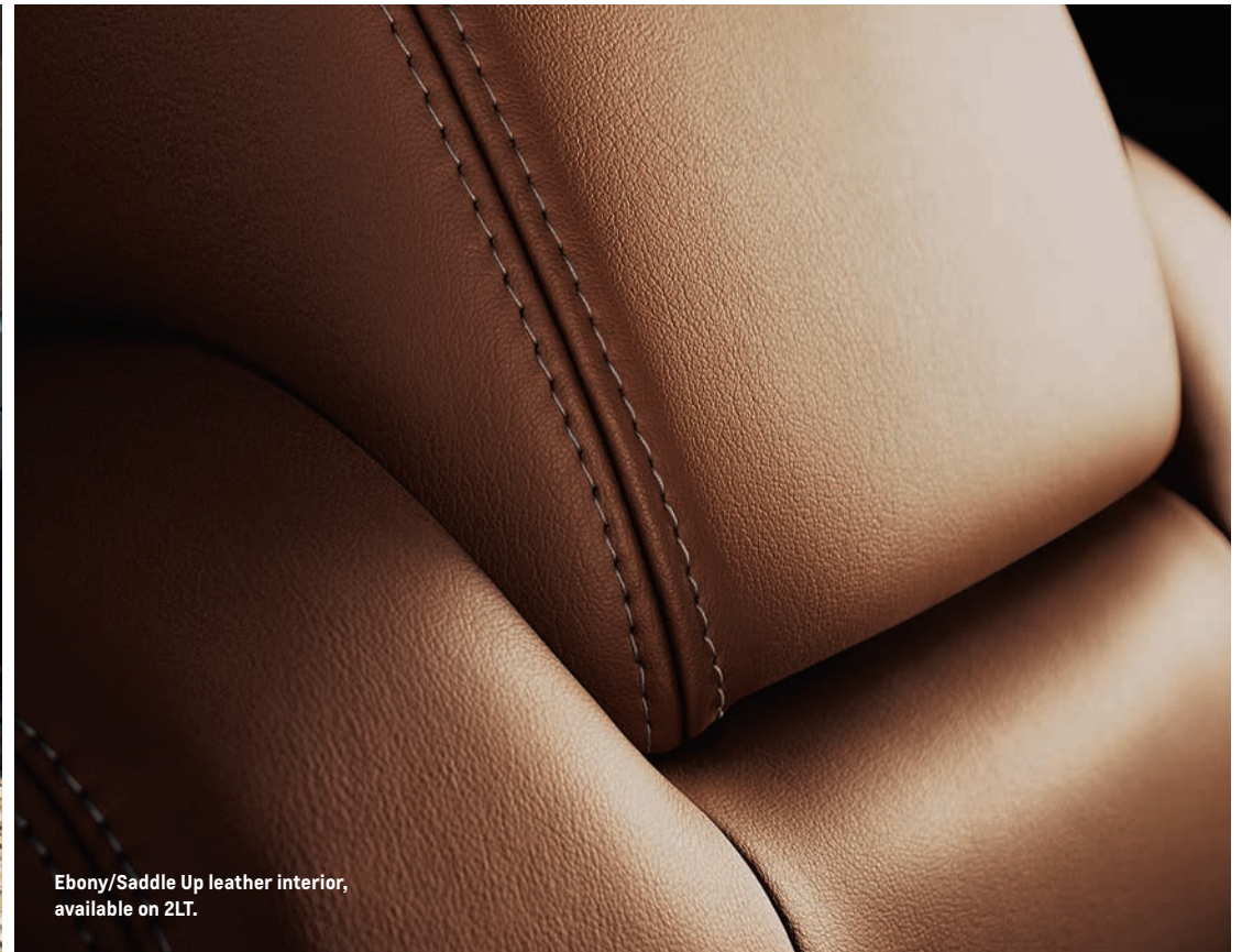
Ebony/Saddle Up leather interior, available on 2LT.