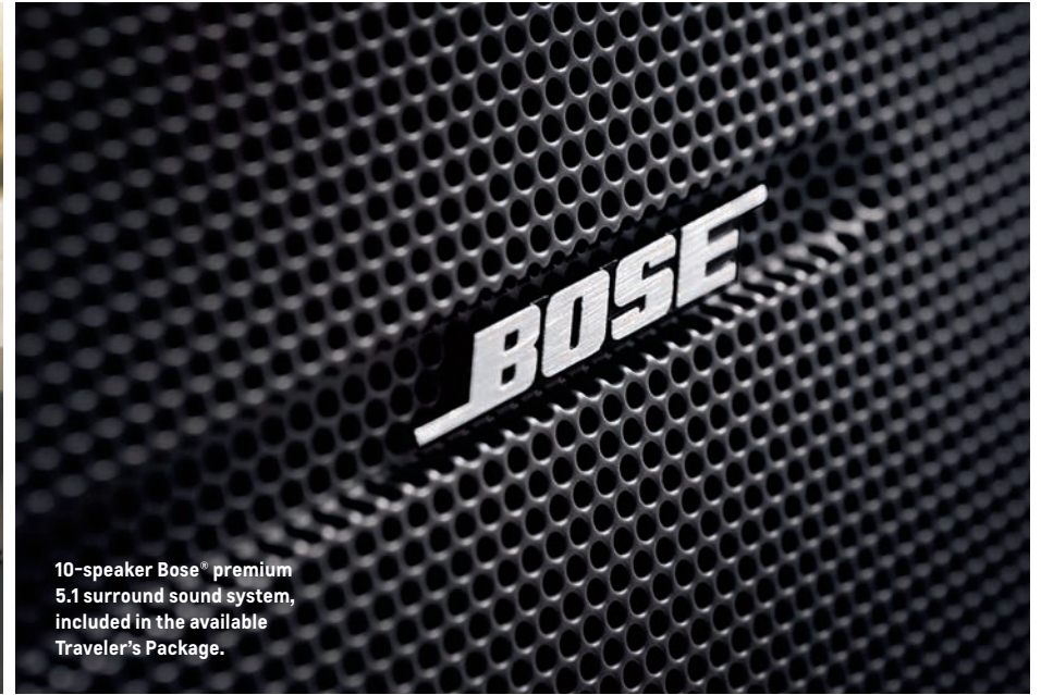
10-speaker Bose® premium 5.1 surround sound system, included in the available Traveler's Package.