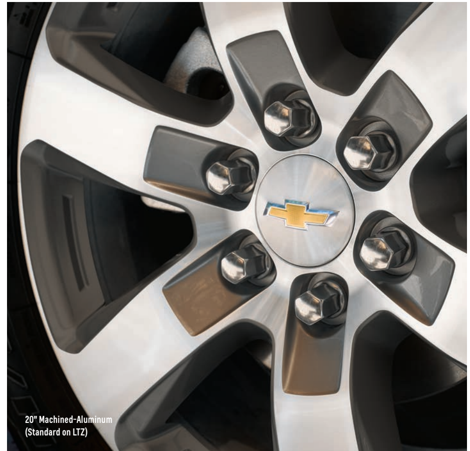
20" Machined-Aluminum (Standard on LTZ)