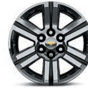
18" Machined-Aluminum (Standard on 1LT and 2LT)