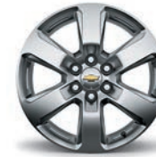
20" Painted-Aluminum (Available on 1LT; requires Style and Technology Package)